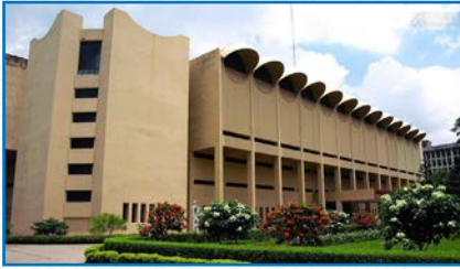
Bangladesh National Museum