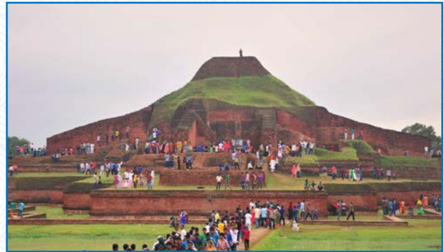
Somapura Mahavihara, Paharpur