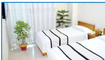
Hotel SEL Nibash