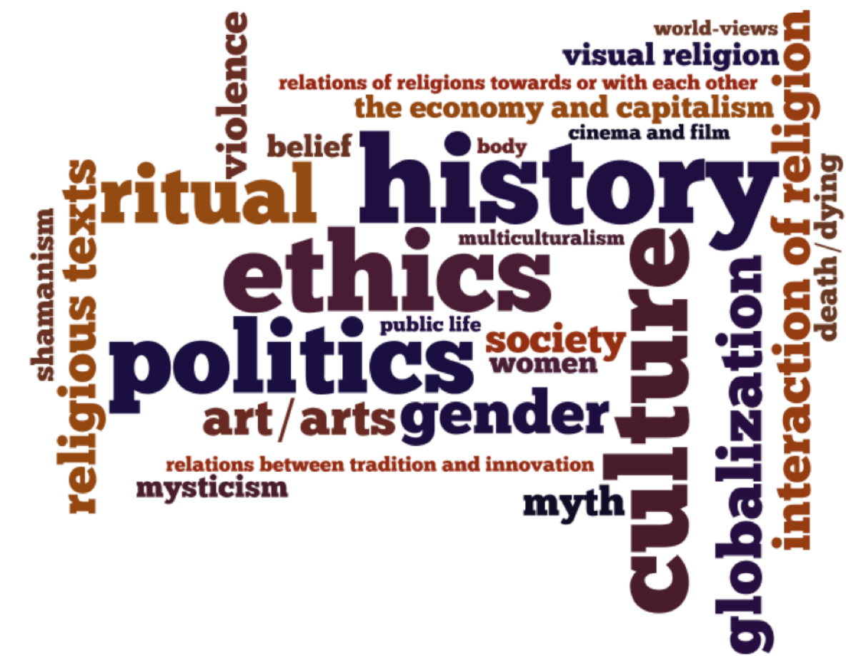
Figure 1: Word cloud of topics mentioned on two or more web pages

popular religion, post-colonialism, power, race, state, and terrorism. The history of the study of religion\ is likewise mentioned by one text only (The University of Ottawa #72). 21 Not represented at all are issues such as evolution or evolutionary theory and material culture (but built environments, i.e. architecture, is mentioned once).