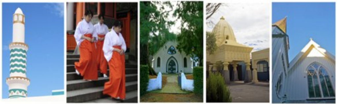
Figure 3, Collage on Victoria University of Wellington web page (May 29, 2011)

and Bush appear as important persons in contemporary religious scenarios. Arguably, Bush and Lennon juxtapose American mainstream Protestantism, power and politics (Bush) and alternative spirituality (Lennon); note that Lennon is much more centrally situated in the composition (even though somewhat to the left), while Bush appears as right wing marginal figure. This is one of the very few visual representations found on a study of religion's web page that suggests that the discipline does not only deal with the prototypical religious histories, but also with modern politics and popular culture. Interestingly, as if to confirm our diagnosis this collage was subsequently replaced by a row of five pictures, out of which four are views from outside of religious buildings without the presence of any human beings (and correspondingly the textual message, which reflected the 'claim of relevance', has been taken out). 35