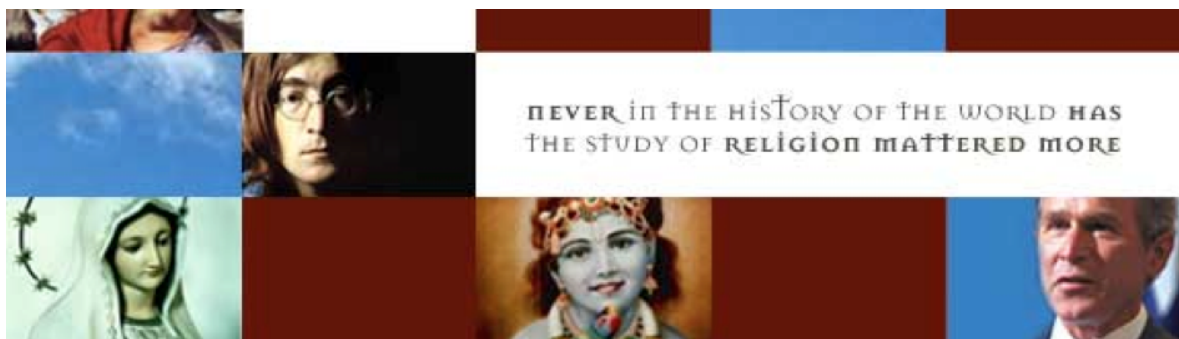
Figure 2, Collage on Victoria University of Wellington web page (March 23, 2011)

There are several cases (11) where the images are presented in a collage. In some few cases (2) collages are used as part of the header on the page with the department logo. What all these have in common, is that they compile images from different religious traditions, from East and West. In a sense, this visualizes the plurality of religion\ and the global perspectives often claimed in the texts. Let us take a look at one example. On the website for Victoria University of Wellington we found the portraits of Virgin Mary, Krishna, John Lennon and former US president George W. Bush (retrieved 2011-23-03).